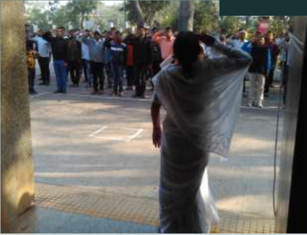
Republic Day Celebration 26/01/2019