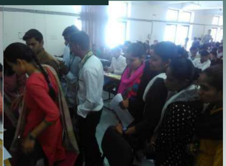
Counseling With Personality Development 27/03/2019