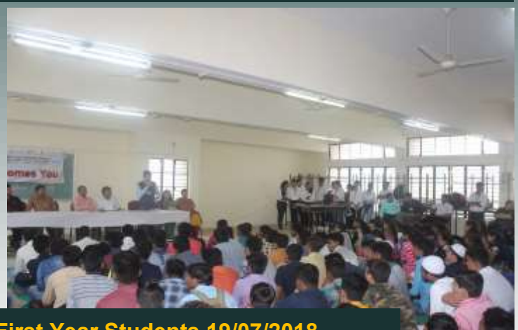
Orientation Programme for First Year Students 19/07/2018