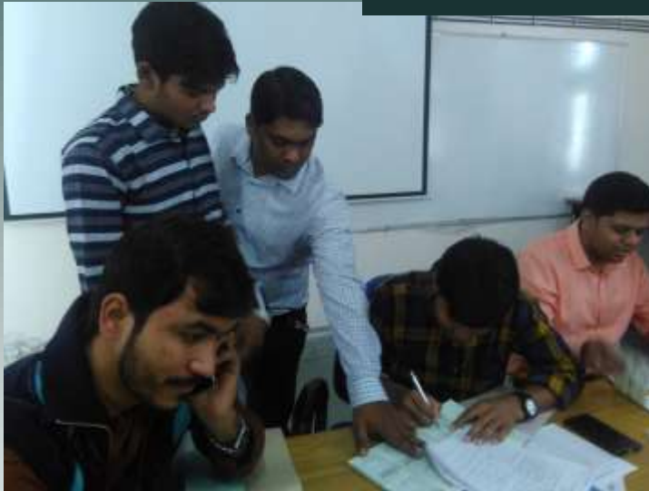
District level Placement Fair 12/02/2019