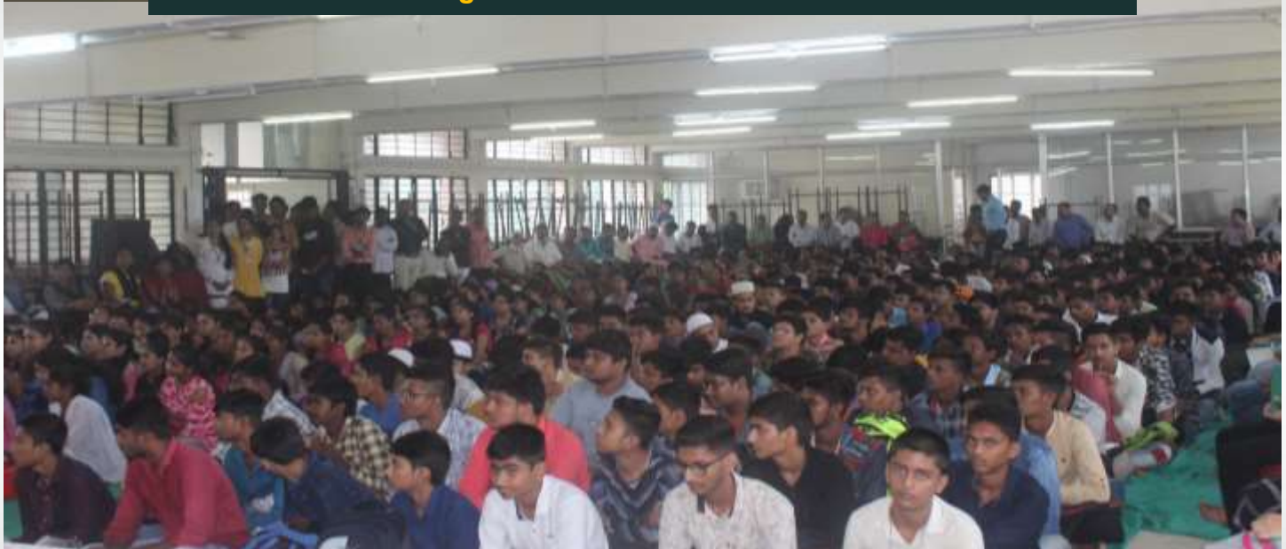
Thalassemia Check Up Camp 04/02/2019