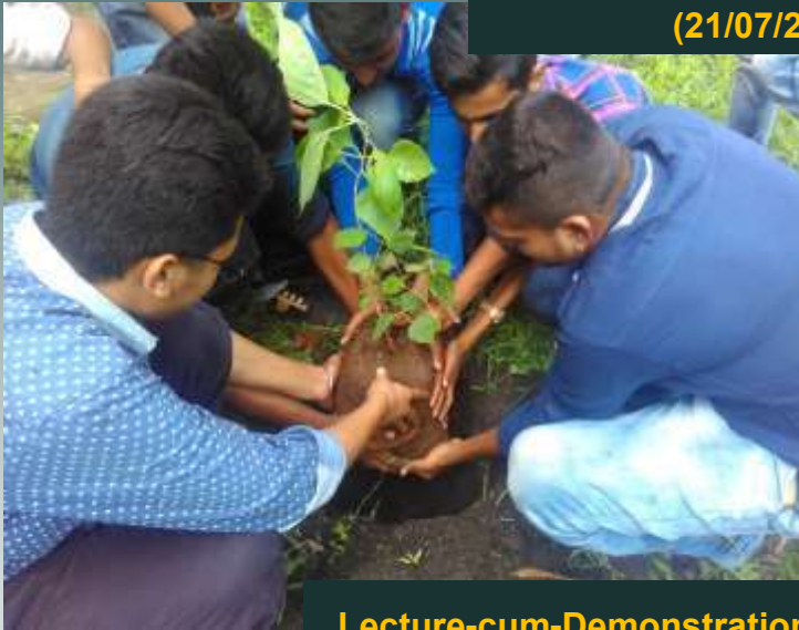
Tree Plantation Programme (21/07/2019)