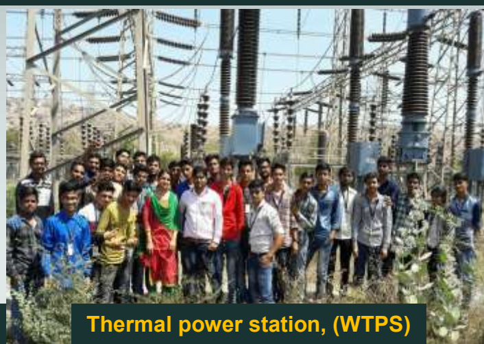
Thermal power station, (WTPS)