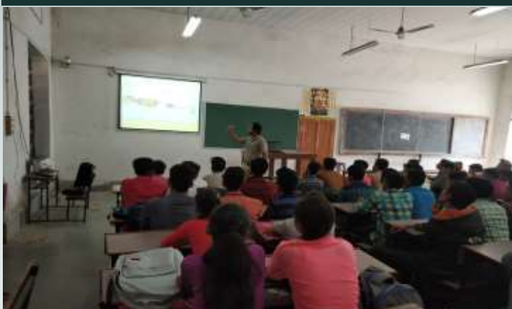
Maintenance of electrical equipment