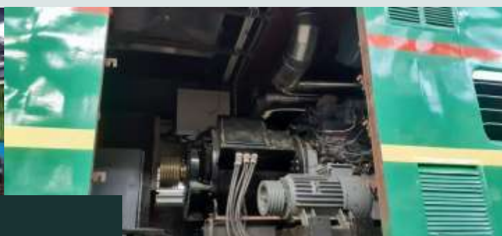
Industrial Visit of Railway loco carriage and Wagon workshop 02/08//2019